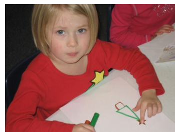
Following directions to draw a Christmas Tree